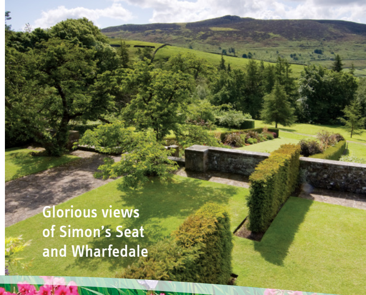
Glorious views of Simon's Seat and Wharfedale